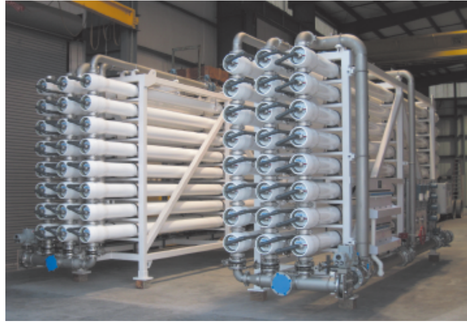
Figure 5 shows the LPRO membranes on the assembly room floor. Each skid will be able to process 1 million gallons of raw water per day at the plant.

Figures 2 through 6 show the LPRO treatment process being constructed at the plant, which came on line in 2008. The project will provide significant benefits to the city and its customers by facilitating the implementation of a long-term water supply and resource management strategy that ensures the conservation of freshwater supplies in the area.