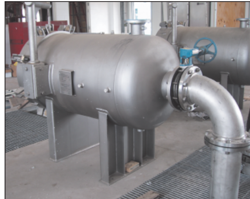
Figure 3, above, shows the sand filter that is used for rough screening and capture of TSS in the raw water. As new UFA wells are brought online, the sand filter will help capture the sand and other solids that could clog the downstream cartridge filter.