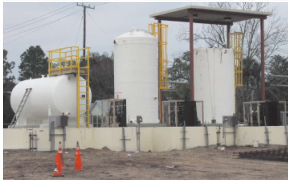
Figure 6 shows the bulk chemical storage area. Chemical additions will be used for pH adjustment, disinfection, odor control, and corrosion inhibition throughout the membrane facility.