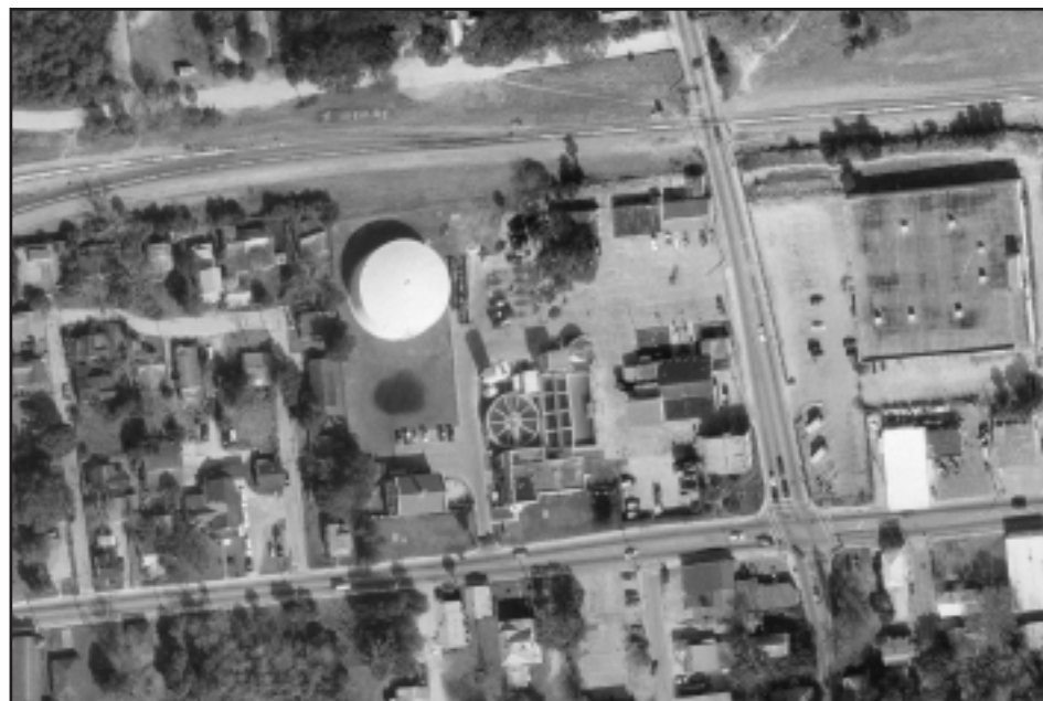
Figure 1: Aerial Photograph of the city of St. Augustine's Water Treatment Plant